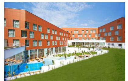
HOTEL TERME SVETI MARTIN ****