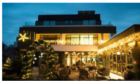
HOTEL CASTELLUM ČAKOVEC****