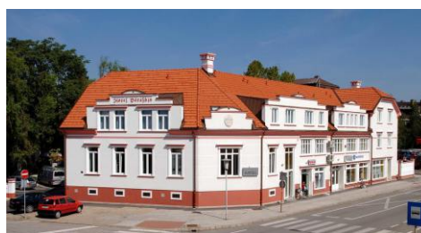
HOTEL VARAŽDIN ****