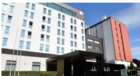
HOTEL TURIST ****

Contact us on: tigar.cicvara@gmail.com All information : www.tigarkarlovac.hr