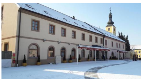
HOTEL AMALIA LUBBREG ****