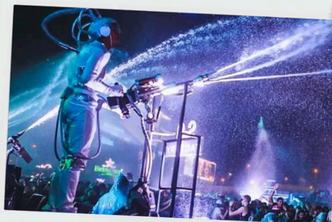
Songkran Concerts & Music Festivals