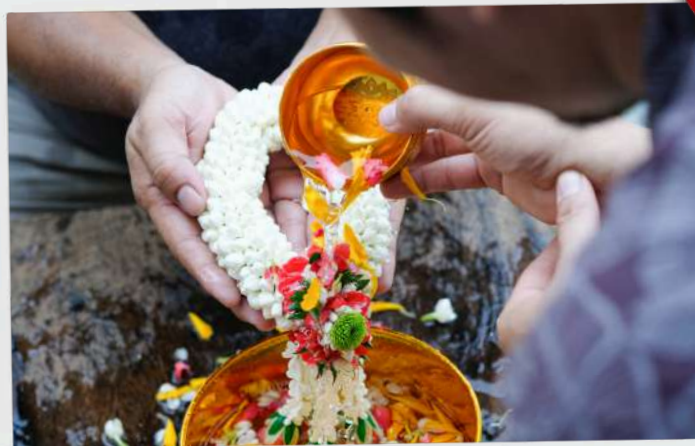
Traditional Water Pouring