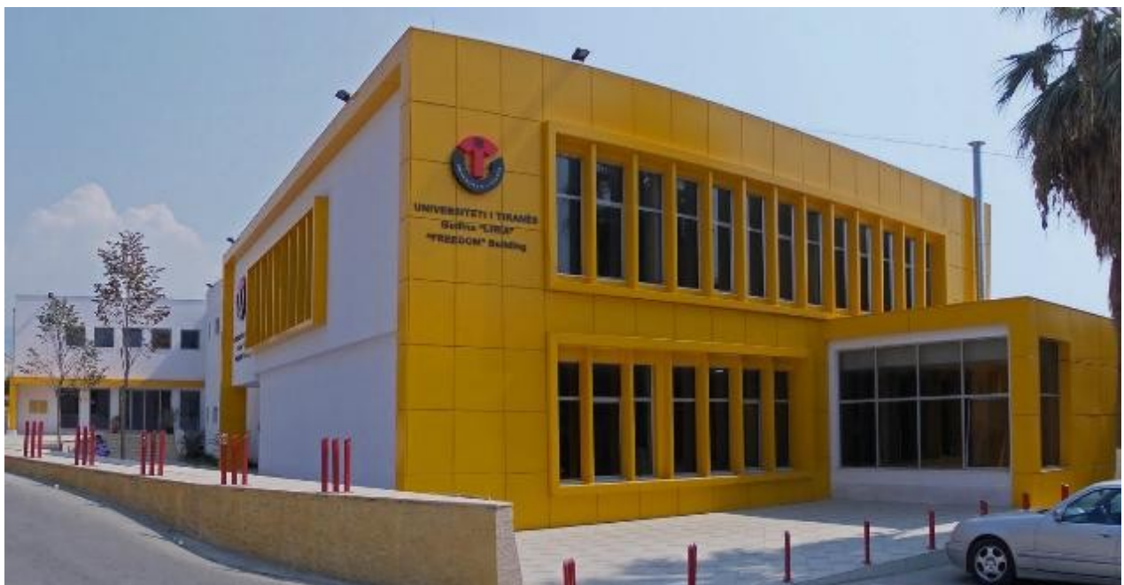
A student dormitory

More info about University of Tirana: https://unitir.edu.al/en/